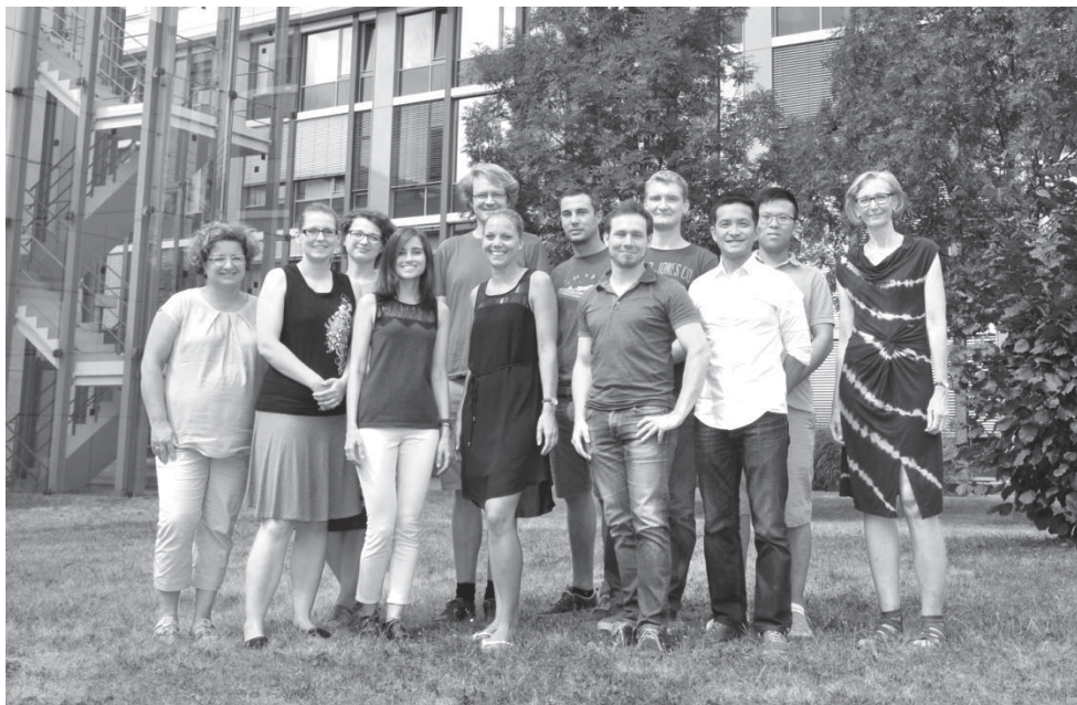
Organizing Committee and Crystallization Team at the Max Planck Institute Magdeburg