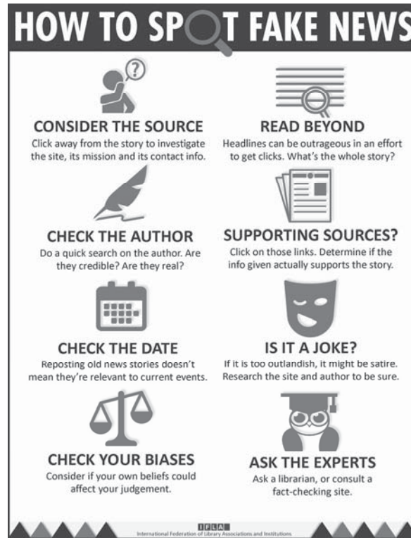
Figure 2: International Federation of Library Associations and Institutions infographic based on FactCheck.org's 2016 article "How to Spot Fake News".