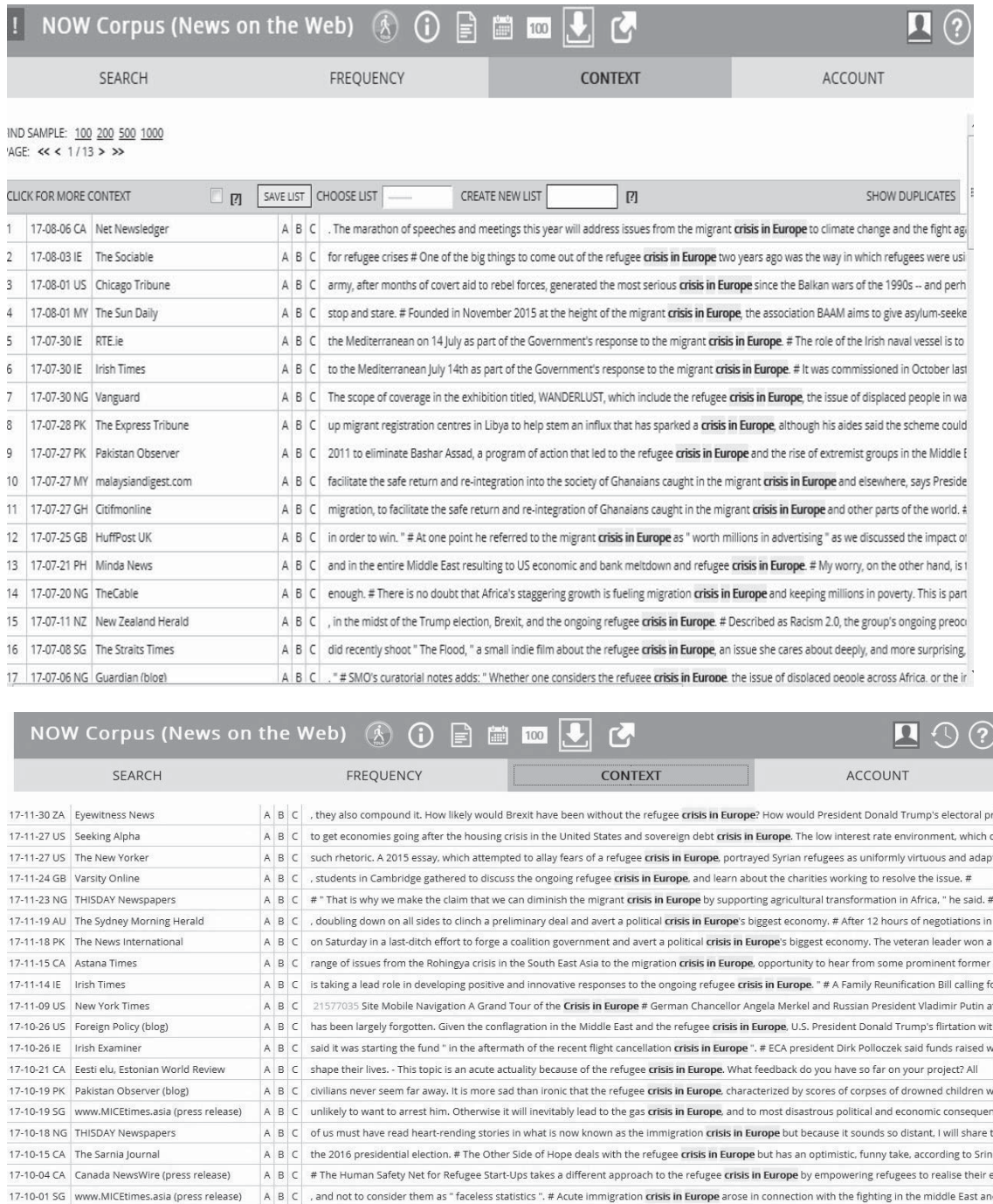
Figure 3: KWIC for “crisis in Europe” in the NOW corpus (04/07/17 and 12/12/17).

An analysis of the first 20 collocates after the notorious “Europe” shows the semantic group of refugee , migrant , migration , humanitarian , Syria(n) , and immigration are clearly prominent with the semantic field of dead , economic , financial , and banking a clear second (Figure 4).