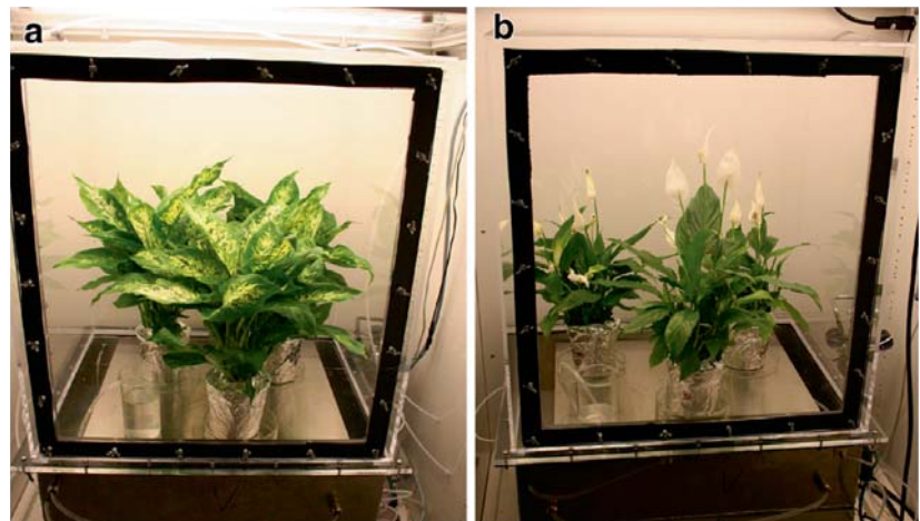
Fig. 2 Biobox equipped with Dieffenbachia maculata (a) and Spathiphyllum wallisii (b)

The climate conditions were set as follows: \text{CO}_2 = 500 \text{ ppm} , \text{RH} = 70\% , temperature = 22 °C, light = 180 \pm 10 \mu\text{mol m}^{-2} \text{s}^{-1} (all parameters related within the Biobox). The duration of the experiment is an important factor. In published studies, the exposure time in chamber experiments varied between 2 h (Liu et al. 2007) and several days (Treesubstunton and Thiravetyan 2012). It is described that plants may need some time for the induction of VOC removal (at least 24 h) (Orwell et al. 2006; Wood et al. 2002) and that the VOC removal may vary diurnally (Liu et al. 2007). Thus, we decided to run our chamber experiments on the VOC removal by aerial plant parts (and by potting soil) for 48 h. Over this time, plants would have enough time for the induction of VOC removal and the natural VOC decline would have decreased due to saturation of surfaces while the plant would continue to remove VOC. At the beginning of each experiment, toluene or 2-ethylhexanol was injected and allowed to evaporate and equilibrate in the chamber. Thus, the first air samples were taken after 6 min for toluene and after 1 h for 2-ethylhexanol. The following air samples were taken after 5, 24, 29, and 48 h for both VOC. Tests on adsorption in empty chambers were conducted to assess potential effects by sorption on chamber surfaces.