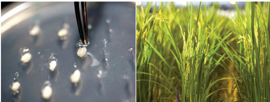
Figure 2-2: Oryza sativa in plant research

Oryza sativa (rice) is a model crop with both agricultural and economical relevance (Fig. 2-2). Since the genome of rice was fully sequenced in 2005 (International Rice Genome Sequencing Project, 2005), its appearance in functional genomics, proteomics, systems biology, green biotechnology and crop improvement has rapidly emerged (Coudert et al., 2010; Itoh et al., 2005; Jiang et al., 2012; Kim et al., 2014c; Xu et al., 2005; Yin & Struik, 2008). Pertinent characteristics responsible for this growing interest in O. sativa as a model crop, include its large significance to human nutrition (FAO, 2013), the relatively small genome size (Goff, 1999) and straightforward transformation as compared to other grass species (Yan & Jiang, 2007). In addition, there is a considerable genomic homology between rice and other cereal species, which increases the likelihood that rice-specific behavior could lead to elucidation of orthologous functions in other cereals (Goff, 1999).