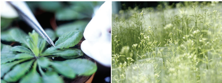
Figure 2-1: Arabidopsis thaliana in plant research

Although Arabidopsis thaliana (thale cress) is often considered a simple weed, this small flowering plant is, without doubt, the most thoroughly studied plant species available. Especially its short generation time, highly reduced genome, regeneration through self-pollination and small stature make Arabidopsis an excellent candidate for research in plant biology (Koorneef & Meinke, 2010). Consequently, in the pre-genomics era A. thaliana emerged as the pivotal plant species in many biological research fields including physiology, biochemistry, molecular biology and evolution. Furthermore, the early sequencing and annotation of its complete genome (Arabidopsis Genome Initiative, 2000) allowed A. thaliana to establish itself in disciplines such as functional genomics, systems biology and biotechnology (Van Norman & Benfey, 2009). Despite its agricultural irrelevance, it has become impossible to imagine plant research without A. thaliana and likely, this simple weed will remain a major contributor to future plant research (Fig. 2-1).