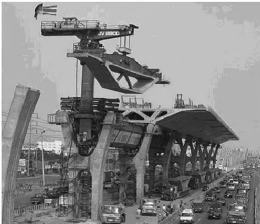
Figure 1.1 Segmental bridge construction in Bangkok [Br5]

In contrast to classical monolithic constructions, a segmental bridge consists of small pieces or slices called segments, which maybe precast, cast in place in their final position in the structure or a combination of precast and cast in place. In other words, it is opposite to the precast girder concept where the bridge is cut longitudinally. In the precast segmental method, the bridge is cut transversally, each slice being a segment. Thereafter the segments are stressed together by external or internal tendons. The erection process of a segmental bridge can be seen in Figure 1.1.