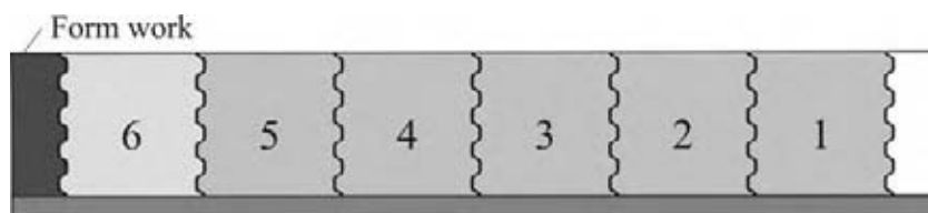
Figure 2.3 Long-line match-cast method