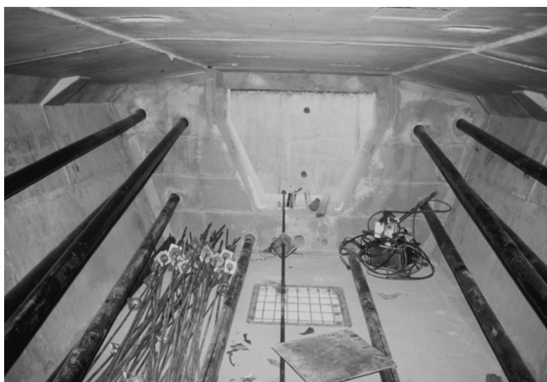
Figure 2.1 External prestressed segmental bridge (SES Bangkok) [Ro1]