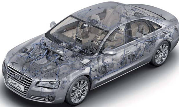
Figure 1.2: The wiring and deployment of new electronic components is difficult because existing components maintain large parts of the available physical space.

and multiple departments of the Original Equipment Manufacturer (OEM) itself deliver components of the integrated device. This is a trend that can be observed already and will increase as the value creation of an electronic based application is very high [Ins04, DH08].