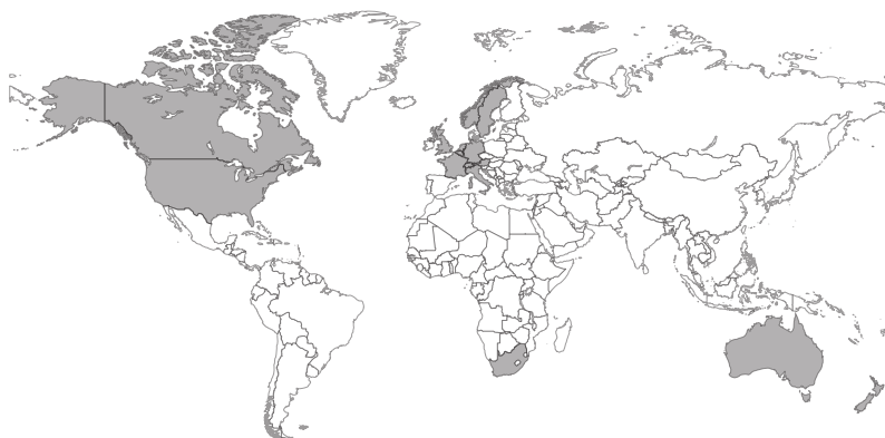
Figure 2.1: Location of the GCD member banks

data such as gross domestic product (GDP) and unemployment rates are included in the empirical analyses. For a detailed description of the explanatory variables, see Table A.1 in the Appendix.