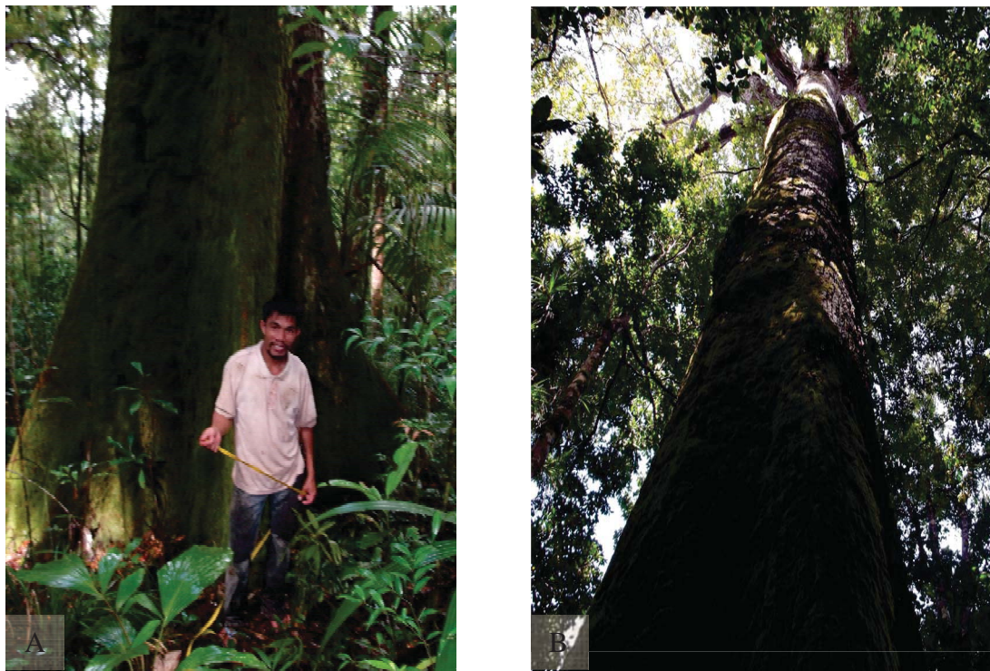
Fig. 4. Physiognomy of a mature S. contorta with an almost 2m dbh (A) and a long straight bole (B) in a primary forest in Leyte.

flowering time is irregular with a mass production in a short 2-3.5 weeks flowering period (Ashton et al. , 1988, Chan and Appanah, 1980). Further, flowering is not simultaneous with other dipterocarps (LaFrankie and Chan, 1991) and also varies in different elevations (Sasaki et al. , 1979). Dipterocarps are pollinated by different insect vectors (Appanah, 1981; Appanah and Chan, 1981; Corlett, 2004; Momose et al. , 1998; Sakai et al. , 1999a). Once developed into seeds, they are short-lived and easily lose their viability, often within three weeks after dispersal. The seeds are usually shed off toward the start of the wet season and germinate three days to two weeks after shedding whether or not they reach the ground. Heavy seed years occur at infrequent intervals normally from five to seven years, rare extreme intervals are two to twenty years, and a few species seed annually (Revilla, 1976; Ng, 1966; Nicholson, 1958; 1960; Wyatt-Smith, 1952 as cited by De Guzman et al. , 1981). During fruiting years, the seeds germinating on the ground form a dense mat of seedlings. The seedlings under the forest canopy can tolerate shade and may not show significant growth for years but are capable to shoot up to the canopy when light becomes available as gaps are formed (Whitmore, 1990).