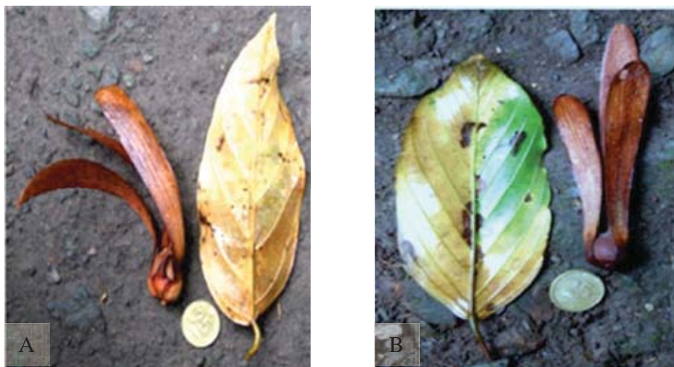
Fig. 5. Leaf and fruit differences between S. contorta (A) and P. malaanonan (B). coin scale: 2cm

Parashorea species were argued to be included within the genus Shorea (Symington, 1943) because of their trait similarities. Ashton (1982) suggested a separate classification due to distinct characters between species of the two genera. In the case of S. contorta and P. malaanonan , distinguishing features can be observed. S. contorta has an unequal leaf base with nerves from seven to nine pairs. The leaves vary greatly in size and increase from seasonal to ever wet habitat. P. malaanonan has stipules that are deciduous, semi-amplexicaul, and are leaving annular scars. Leaves are glabrous on the under surface, in length about 15 cm. The style is long, exceeding the sepals (De Guzman et al. , 1981). Further, Parashorea has plicate seedling leaves and globose or verrucose with lenticellate fruit nut (Ashton, 1982).