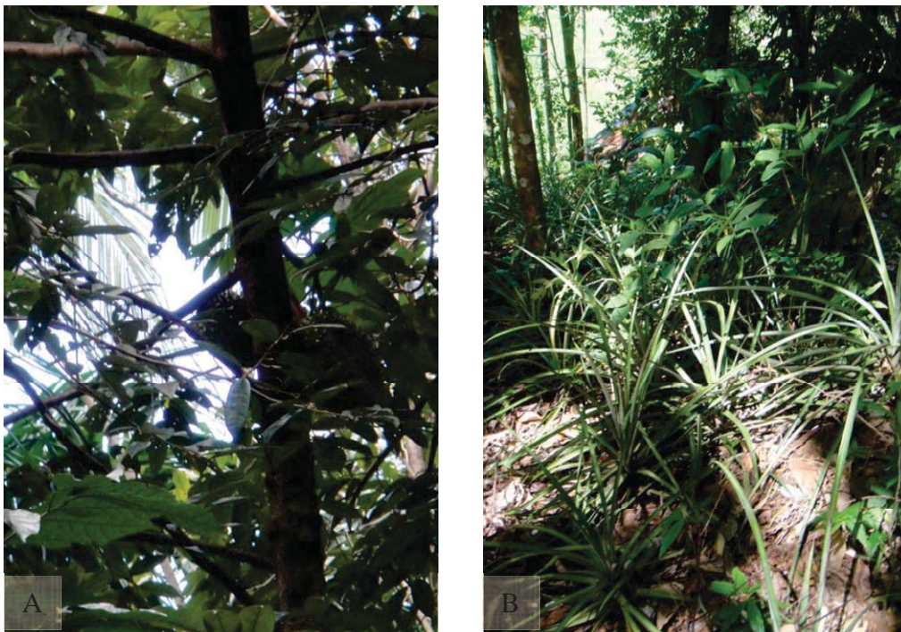
Fig. 3. One of the fruit trees (A: Durio zibethinus ) and agricultural crops (B: Ananas comosus ) planted in rainforestation areas.

The continuous efforts for reforestation in the country had accounted to 352,000 ha of planted forests in 2010 that corresponded to 5% total forest area. It was an increase from 302 000 ha in 1990, 327 000 ha in 2000, and 340 000 ha in 2005. Accordingly, the annual change rates of planted forests were 0.80% from 1990 to 2000, 0.78% from 2000 to 2005, and 0.70% from 2005 to 2010. The report further indicated that 99% of trees in plantations were introduced species (FAO-FRA, 2011).