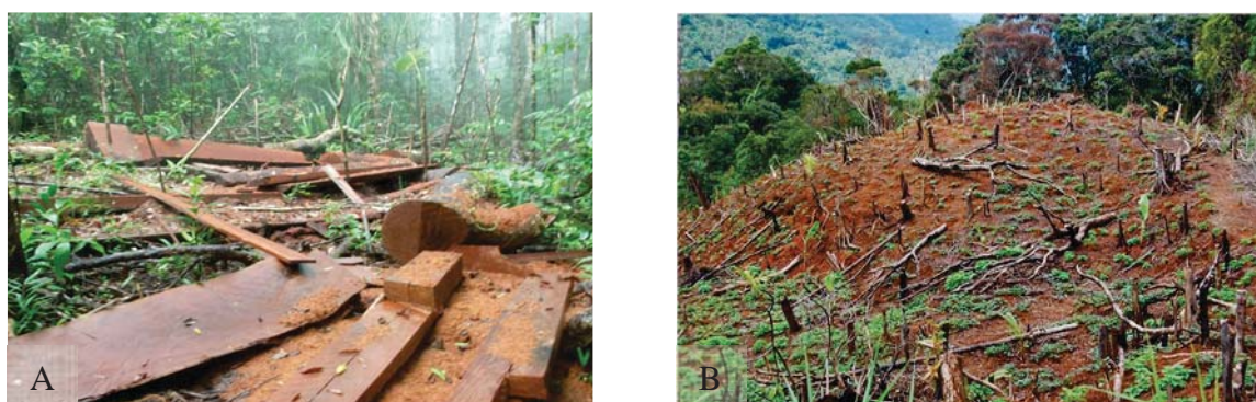
Fig. 2. Fresh illegally-cut dipterocarp in Leyte (A) and the on-going kaingin in Samar (B).

The rapid depletion of the forests in the country from the last century (FMB, 1997; ESSC, 1999; DENR, 2002; FAO-FRA, 2011) was considered to be one of the most severe forest destructions in the world (Heaney, 1998). The vast denudation was due to logging, fuel wood gathering and charcoal making, shifting cultivation and permanent agriculture (Fig. 2; Kummer, 1992; FMB-DENR, 1999). It was reported that there were about 20M Filipinos living in upland watershed areas and half of whom were dependent on shifting cultivation for their livelihood (Cruz and Zosa-Feranil, 1998). These activities had contributed to 13M ha of open grassland, of which 5.2M ha need immediate rehabilitation (FAO, 2005). With regard to deforestation rate, the average was 170,000 ha per year from 1969 to 1973 (FDC, 1987) and was expected to increase to about 190,000 to 200,000 ha in the next 20 years (Revilla, 1997). With continued deforestation, the country has been considered as one of the hotspots or areas of concern in the world (McNeely et al. , 1990; Myers et al. , 2000).