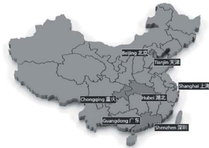
Figure 2. Map of approved carbon trading schemes in China (from IETA, 2013).

Carbon markets, both compliant and voluntary, can provide an additional source of revenue to support forest-based solutions to climate change. China has planned to establish a national carbon market to meet its climate targets. In 2008, three emission trading exchanges were set up in three municipalities: Beijing, Shanghai and Tianjin. In 2011, NDRC selected 5 cities (Beijing, Tianjin, Chongqing, Shanghai and Shenzhen) and 2 provinces (Hubei and Guangdong) as shown in figure 2 for carbon trading pilots. The carbon trading in Shenzhen, Shanghai and Guangdong was put into operation in 2013, and the rest will start in 2014. This carbon pilot program will serve as cornerstones for the establishment of a national-level unified emissions trading market between 2016 and 2020.