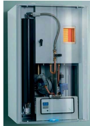
Figure 2.2 Vaillant CHP System