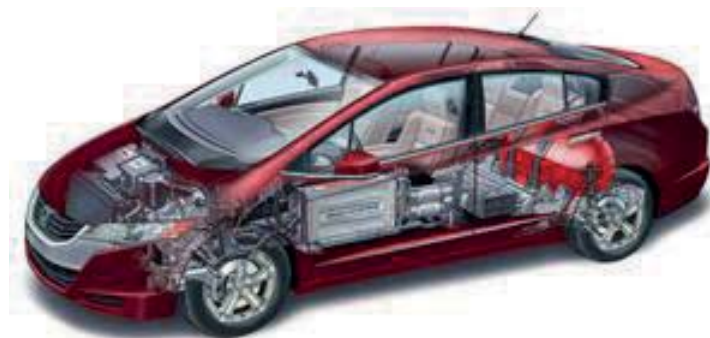
Figure 2.4 Fuel cell car