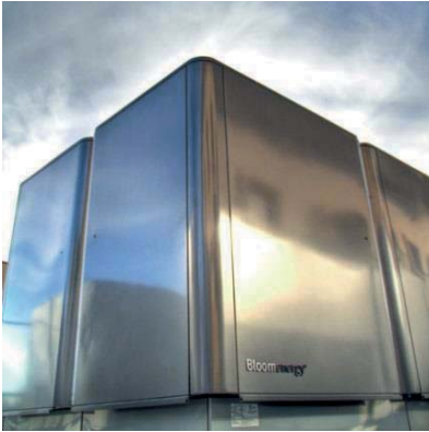
Figure 2.1 CalTech, Bloom Energy