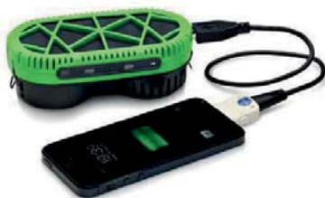
Figure 2.3 Portable fuel cell application

Batteries don't promise sufficient fast recharging time and energy density for long-term operations both of which are key properties for portable and transportation applications. Fuel cells assure a viable option for battery applications in small power range between 0-100W [19]. The implementation of fuel cells in transportation is one of the foremost fuel cell applications. Dynamic response requirements are the main characteristic property of portable and transportation applications. Volume and weight play also an important role as design parameters. Two selected examples from portable and transportation applications are given in Figure 2.3 and Figure 2.4. The product range differs from small sized fuel cells for the recharging of mobile phones to bigger sized fuel cells for power train in automotive applications. The mechanical requirements of these fuel cell applications depend on the type of the fuel cell, size of the fuel cell stack and application based specifications, which can be varied distinctively.